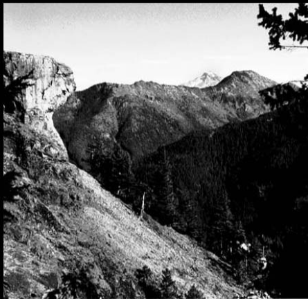
Battle Ax Mountain, Oregon