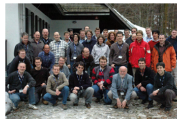
Participants at 5th ICA Mountain Cartography Workshop Bohinj, Slovenia March 29 - April 1, 2006