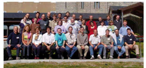
Participants at 4th Mountain Cartography Workshop Vall de Núria, Catalonia Sept. 30 - Oct. 2, 2004