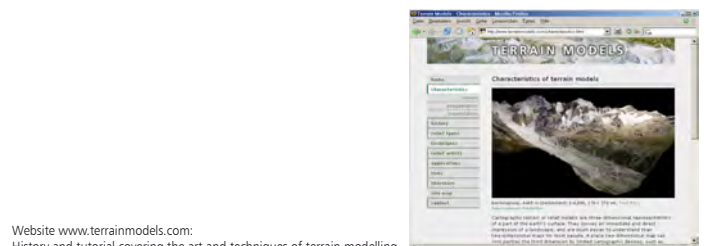
Website www.terrainmodels.com : History and tutorial covering the art and techniques of terrain modelling