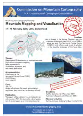
Flyer pre-announcement next workshop