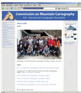
New commission website http://www.mountaincartography.org